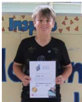
Xander Area 11