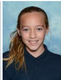
Ella Area 10