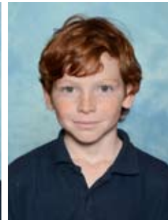
Logan Area 12