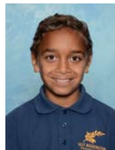
Brandon Area 12