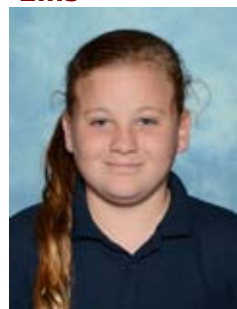
Leah Area 12