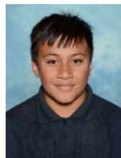
Salo Area 11