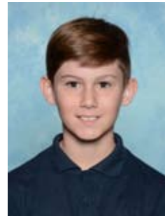
Hudson Area 12