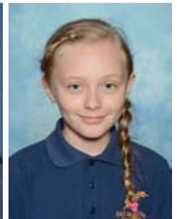
Abbey Area 11