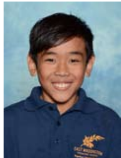
Romeo Area 11