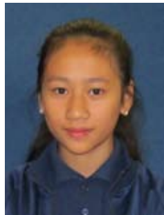
Ku ku Area 10