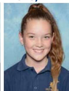
Breanna Area 11