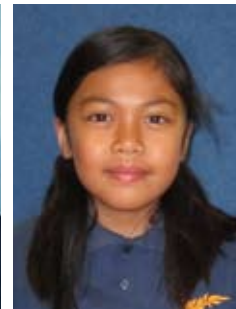
Daphne Area 11