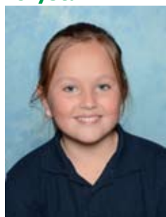
Kirsty Area 12