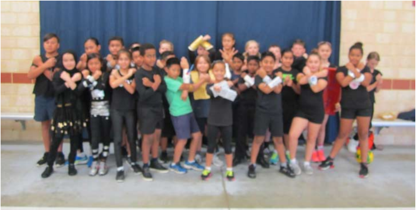
BEST CLASS AWARD AREA 9