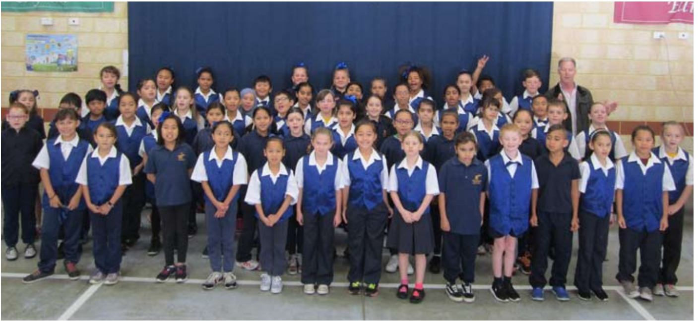
BEST CLASS AWARD AREA 22